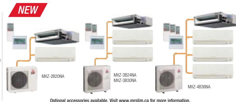
Optional accessories available. Visit www.mrslim.ca for more information.